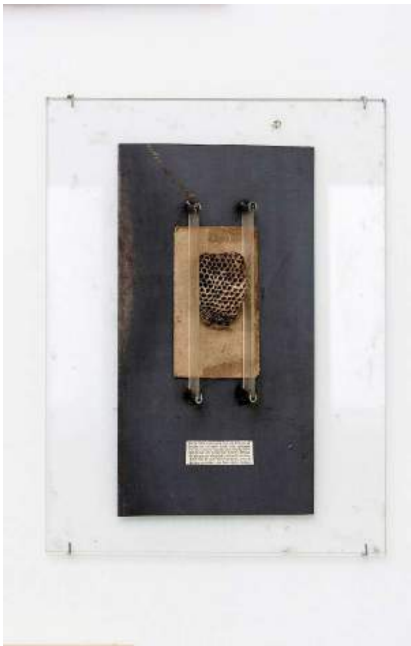
Over de Biën

Steel, glass, bee's nest, cardboard and paper (ca1750), glue.