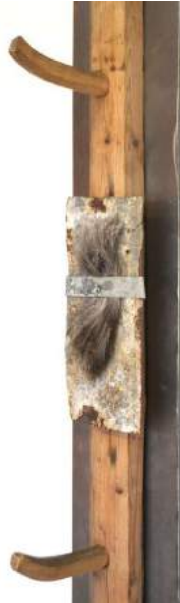
Vertical structure with deer hair Steel, wood, deer hair, glue 100 cm x 15 cm x 15 cm 2024