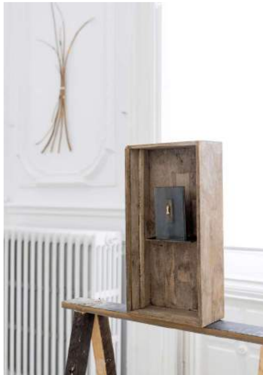
Laet ons uyt het eyndigen van den tyd leeren

©In private collection. Foto: David Samyn