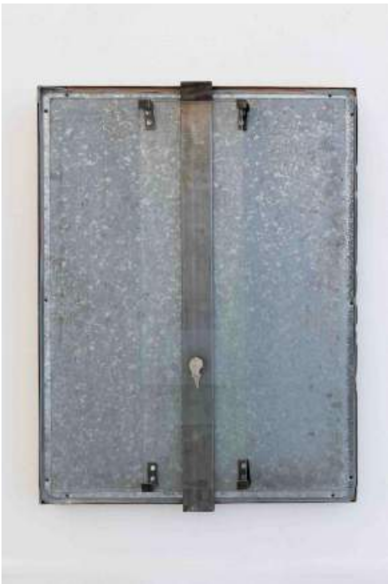
Studies of a bird II, III (detail)

Steel wood, bone, glue 66cm x 51 cm x 8 cm 2024