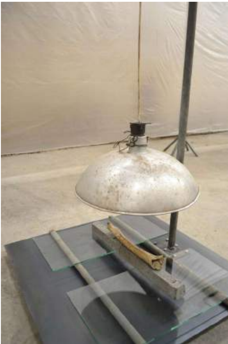
Quis ut Deus (details)

Mixed media ca: 500cm x 250cm x 220cm 2023