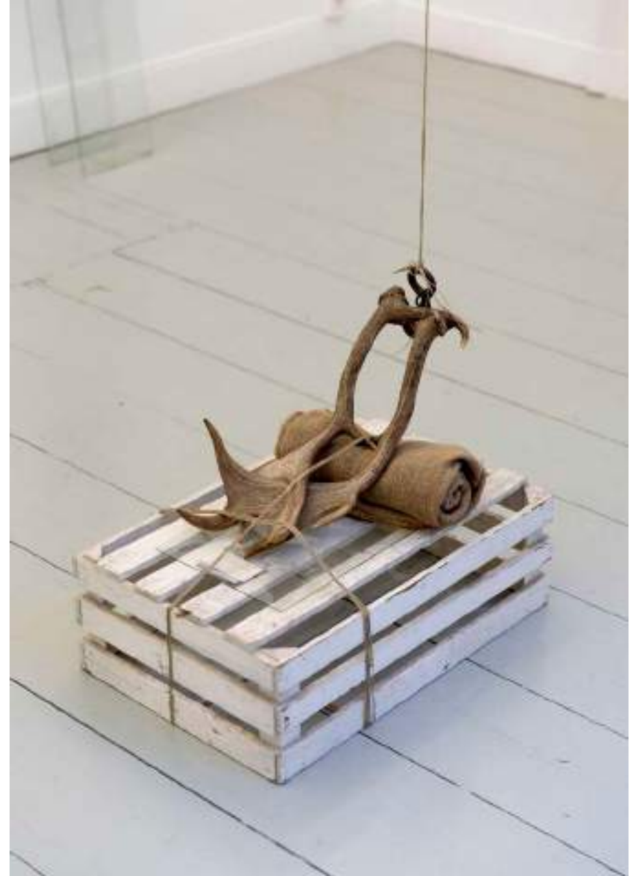
Dienende om den Hemel te verkiezen

Wood, rope, glass, felt, pages from an old book ca1750, burlap sac, antlers of a fallow deer, wax, metal Variable height x 40 x 60 cm