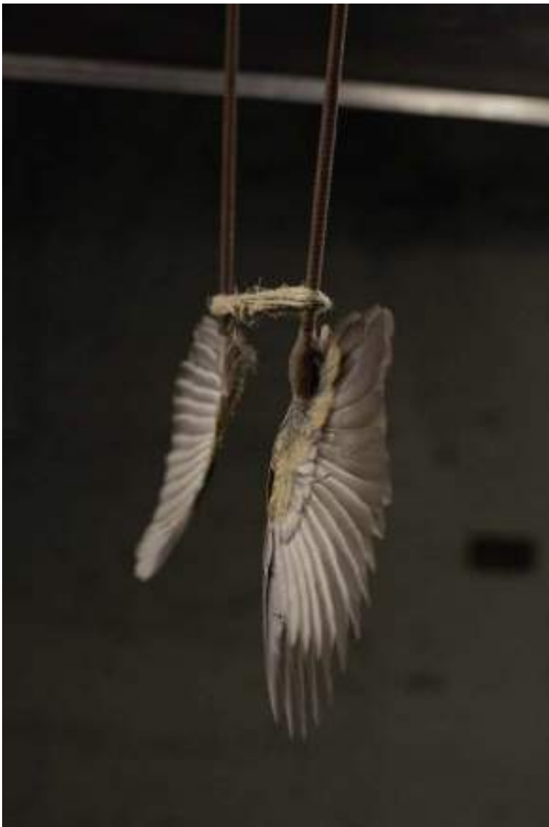
Mulier Amicta Sole