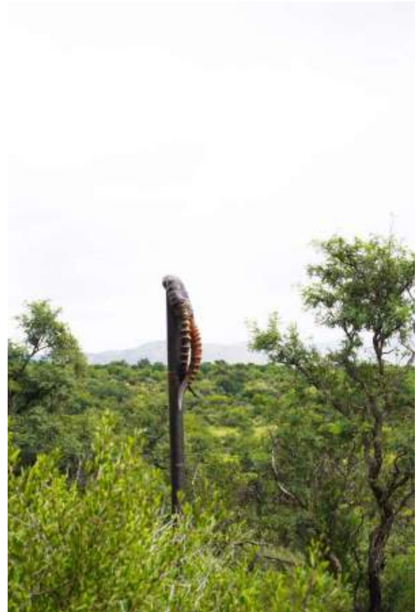
Hilltop sentries (detail)

Jeffe also participated in two international artist-residenties so far, one in Finland in 2024 and one in South Africa early 2025